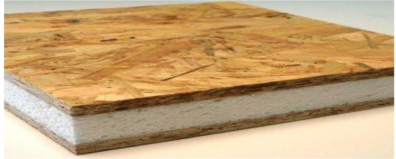
Fig. 2.5 Structural Insulated Panels [17]

constructed in industries and is a large panel of 24^{\circ}x8^{\circ} . An image installation of the same structural insulated panels is shown in figure 2.5. Board can be made up of sheet metal or wood or even from cement also. It might have a little higher cost but is beneficial in the long run [16]. It consumes less time in installation as it is directly available as ready to use the material. It also consumes very less energy in operation. In research, it was found that the buildings made by using SIPs are 40% more economically beneficial than traditional buildings.