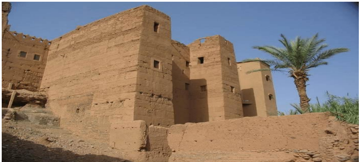
Fig. 2.2 Earthen Structure [7]

The earthen structure is the building or structure made from soil dirt, clay, gravel, and lime. This is the traditional material that is being used from prehistoric times. According to recent statistics, the percentage of earthen houses will be around 50% in the next 15 years as per the study conducted by Niroumand, H [6]. The construction of buildings by using rammed-earth, adobe, and other earthen materials is considered as the best evergreen material. These materials have benefits in costs, aesthetics, acoustics and heat insulation, and low energy consumption. However, few limitations include weak earthquake wearing forces. But still, strength can be increased by adding bamboo, canes as beams and pillars for an extra [8]. In Figure 2.2, an earthen building is shown which is made up of soil dirt, clay, gravel, and lime. This type of buildings has traditional pieces of evidence as it is still used in modern houses. As per the record of Down to Earth magazine, India has 65 million mud houses out of 118 million total houses [9].