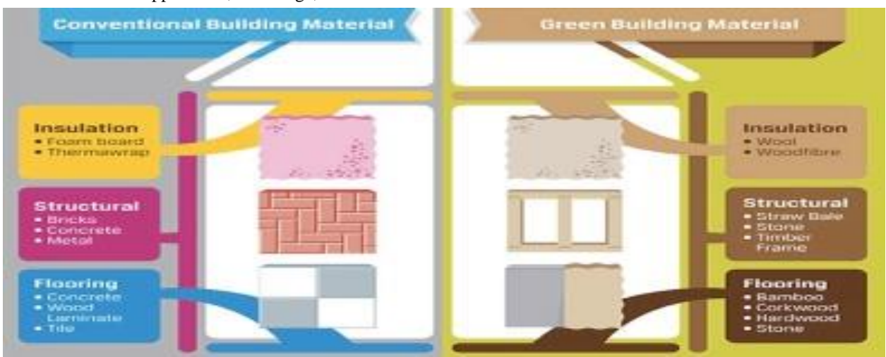
Fig. 2.1 Material Comparison [3]

transportation and shipping costs because of its easy availability [4]. These green building materials have properties like Renewability, Reusability, Easy availability, high energy efficiency, and Low/Non-toxic nature [5]. So, now the question arises what are the few building materials which are substitute to the conventional material. In the upcoming section few green building materials such as earthen structures, straw bale, ICF, etc. are discussed in detail which includes its application, advantage, and limitations.