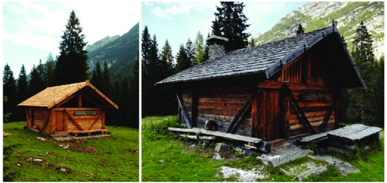
Fig. 2.6 Traditional Wooden House [19] DOI Number: https://doi.org/10.30780/specialissue-ICACCG2020/023 Paper Id: IJTRS-ICACCG2020-023 @ 2017, IJTRS All Right Reserved, www.ijtrs.com

So, on the basis of the properties of these materials, we can conclude that earthen materials can be used in hot areas because it provides good heat insulation. But it cannot be used in high prone seismic zone areas because of its weak earthquake wearing forces. In the seismic zone, if we use earthen material then extra support is needed by bamboo, canes, etc. Strawbale can be used in open humid areas because of having good air inflow through pores of the straw bale wall. But it is needed to protect it from fire exposure because of its low combustion temperature. Insulated concrete forms and structural insulated panels are widely used because of its thermal insulation and U.V. ray insulation to protect it from heat rays. Wooden houses are the best and widely used green building material because of its local availability and easy installation properties. In terms of price, it might be costlier but will give high returns in the long term. After construction, a green building needs to be evaluated. There are few agencies which provide certifications to green building like IGBC is a certification agency of India. The certification agency of the U.S.A. (USGBC) is considered to be the best and is widely accepted. USGBC established LEED for certification is discussed below in detail.