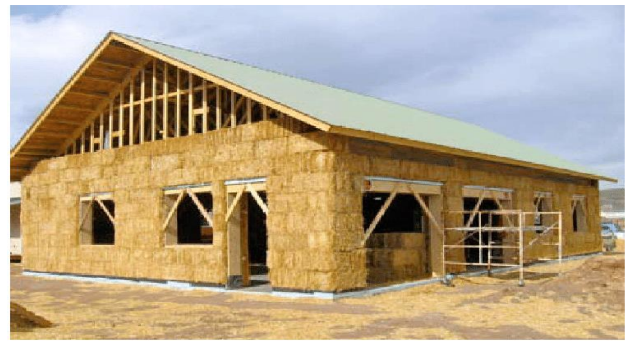
Fig.2.3 Straw Bale House [11]

made up of straw bales and wooden framework for extra support. Straw bales buildings were first discovered by the settlers of the sandhill region of Nebraska [12]. It has many advantages such as low cost, easy to install, cost efficiency and it is fully biodegradable [13]. It has certain limitations such as high exposure to fire, thick wall width which means that most of the area is un-usable.