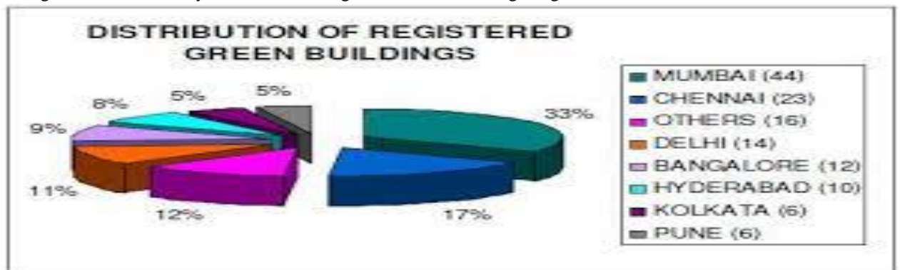
Fig. 3.1 Distribution of Registered Green Buildings [25]

In figure 3.1, which is a survey of green buildings in India carried out by Roy T in the year 2008 Roy T., we can see that Mumbai has the highest distribution of green buildings and Pune has less contribution towards registered buildings. Alone Mumbai has contributed 1/3 of the nation's green building. But it can be seen that it is only limited to big cities in the country. Lack of knowledge about these buildings might be a reason in small cities.